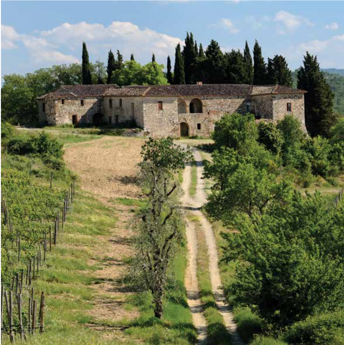
Above: Rancia, from the ancient Frankish "Grange": farm-monastery dating to before 1000. Previous page: Fèlsina